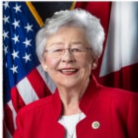
Governor Kay Ivey 54th Governor of Alabama